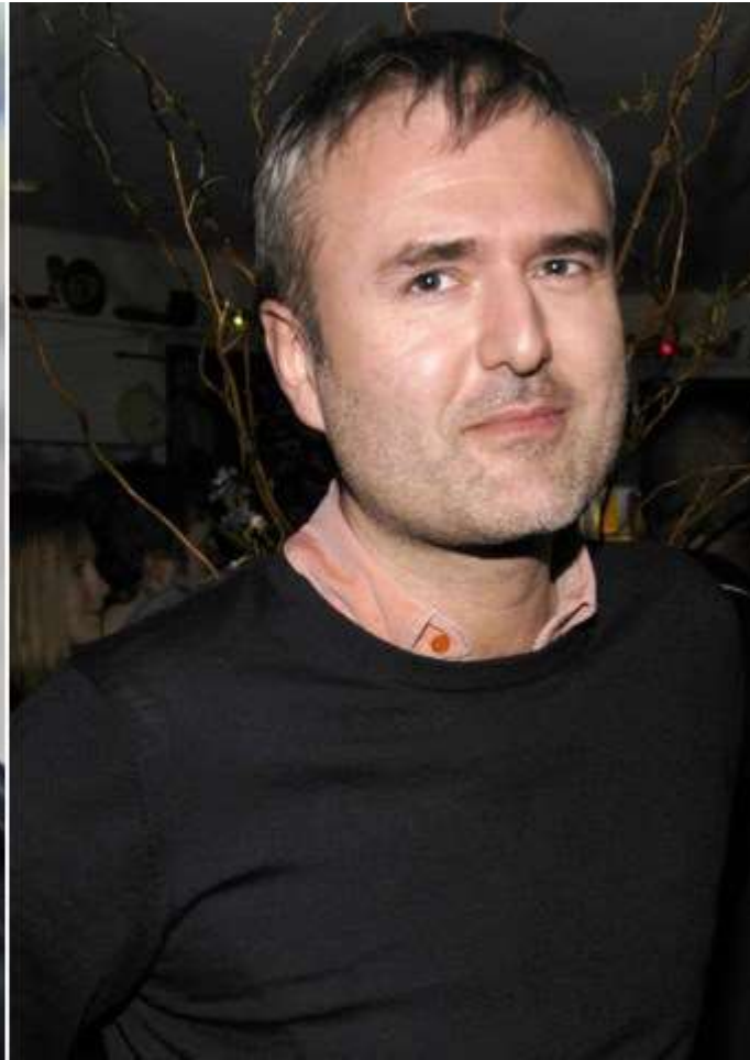
Hulk Hogan (left), Nick Denton